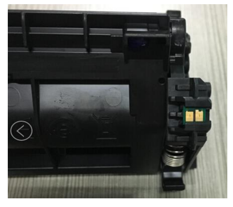
Press this button. Meanwhile, gently push the chip leftward.

Draw out the OEM toner cartridge from your printer. Make sure the chip face to you.